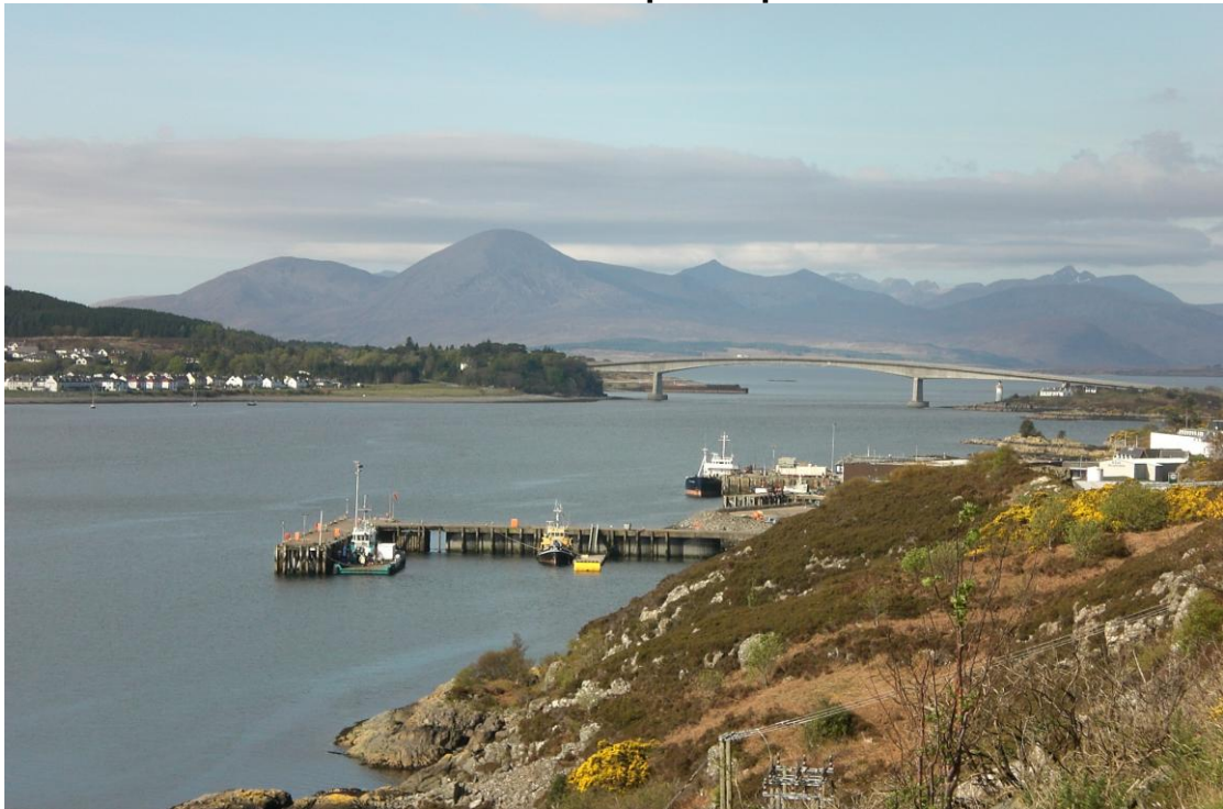
The bridge to the Isle of Skye (above)

Egroeg, 34 Lochbay, Waternish, Isle of Skye, IV55 8GD Tel: 01470 592700 Email: inspiremeplease2@aol.com