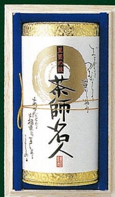
A-50 170g can with wooden box