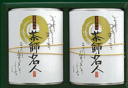
AK-30 70g can