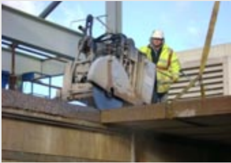
72HP diesel floorsaw cuts reinforced concrete floorslab to form openings for car park ramps