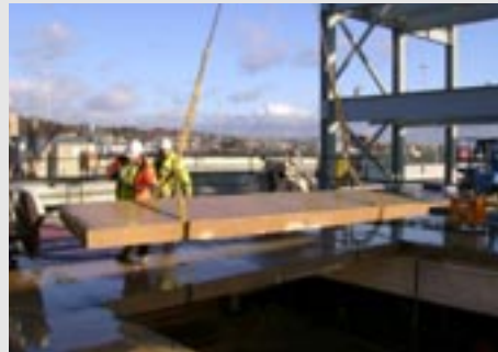
Section of reinforced concrete floorslab is lifted out after diamond saw cutting

Critical to the success of the operation was ensuring the rigorous application of Health & Safety procedures to safeguard the well-being of TCC operatives within a carefully controlled working area.