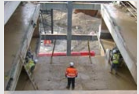
Saw cutting progresses on 3rd level opening viewed through clean cut edges of the two levels above (previously saw cut out)

All operatives and machinery were secured using harnesses and restraints to ensure optimum site safety.