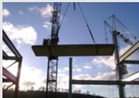
Section of saw cut reinforced concrete floorslab is lifted away by crane for disposal

TCC replicated the working process for each of the 16m x 5m openings in the 200mm thick cast reinforced concrete slabs. First holes were diamond drilled along the lengths of the slabs to fix straps that would hold the concrete sections as they were being cut. Once cut, each section was lifted clear until each opening was complete.