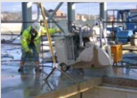
Diamond blade on floorsaw cuts opening whilst operator wears full safety harness restraint system

When High Wycombe town centre was being redeveloped, TCC was contracted to undertake an important element in the overall scheme.